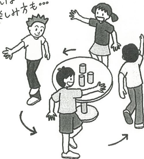
Tinker, Tailor, ~